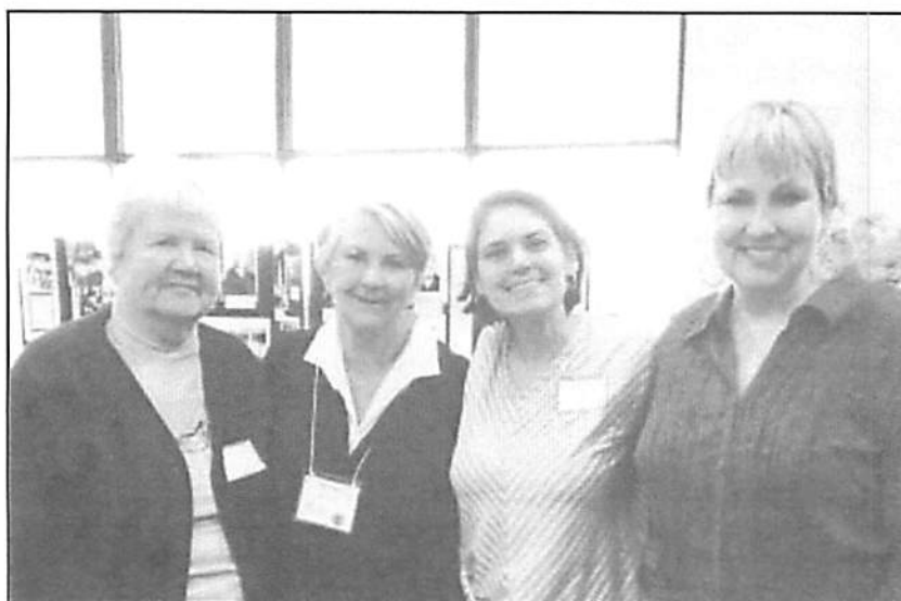
2014 Upcountry Family Reunion

Other information includes: unit histories for both the Union and Confederate Armies, descriptions of 384 significant battles, sailors records, prisoner of war records, and burial records. (Posted by Dick Eastman) December 16, 2013. (Free Standard Edition of Eastman's Online Genealogy Newsletter. ( http://www.eogn.com ))