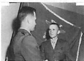
153. Unknown Soldier