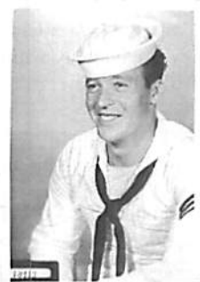
156. Unknown Soldier