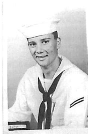
158. Unknown Soldier