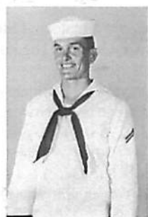
157. Unknown Soldier