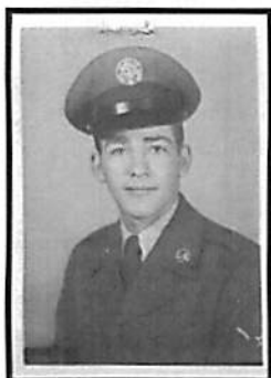
151. March 1951, San Antonio Soldier.