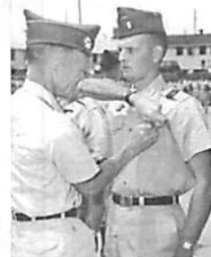
159. Unknown Soldier