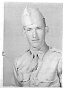
154. Unknown Soldier