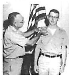
160. (20 Jul 1964) Unknown Soldier